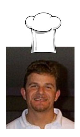
Preparing Food Monday-Saturday