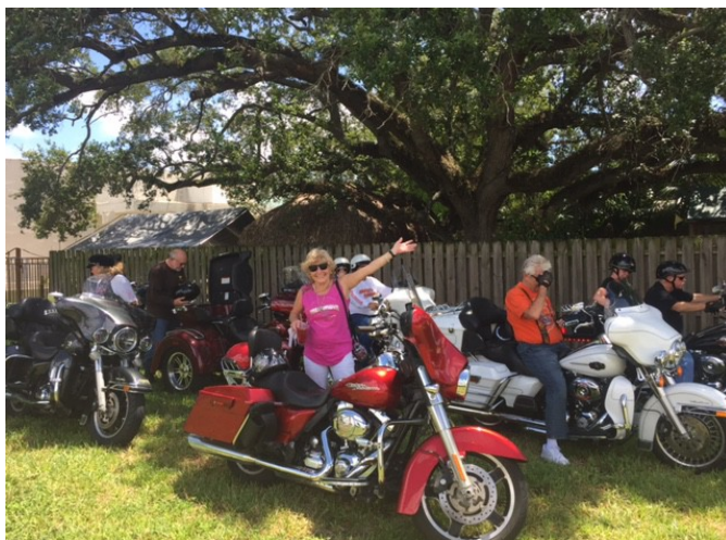
Poker Run July 2016