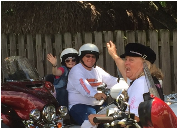
Poker Run July 2016

SUNDAY'S @ 2PM MONDAY'S @ 7PM FRIDAY'S @ 7PM